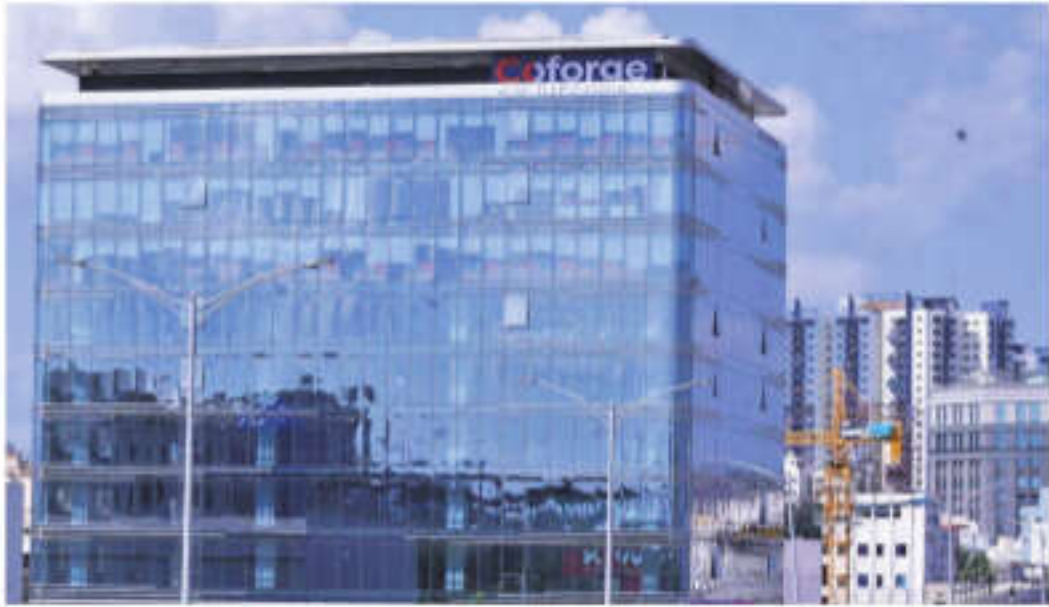
Acquisition will position the company as capability leader in AI-led engineering services underpinned in data and cloud. Encora, with its Silicon Valley roots, brings strong AI-native DNA

The company will acquire 100% of shares of Encora US Holdco, Inc. and Encora Holdings Ltd (Cayman) from Advent International, Warburg Pincus and other minority shareholders, whereas Encora will have 21.25% in the combined firm, Coforge said in regulatory filings. The enterprise value of the transaction is $2.35 billion. The company said the acquisition is a defining moment for