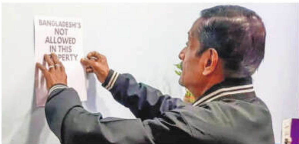
A hotel owner in West Bengal's Siliguri pastes a notice banning Bangladeshis | P11

Reports say thousands of Indians have been affected with several people who travelled to India specifically to renew their visas being stranded.