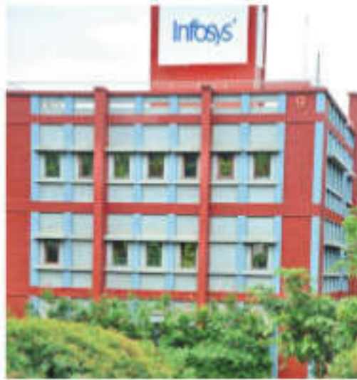
These new hires will be guided and mentored to work on complex problems, advanced technologies, and enterprise grade platforms for our customers

The company is planning to recruit engineering and computer science students for specialised roles for a salary package of between ₹7 lakh and Rs 21 lakh. According to media reports, a fresher joining as a specialist programmer L3 (trainee) will earn ₹21 lakh a year. Those hired as specialist programmer