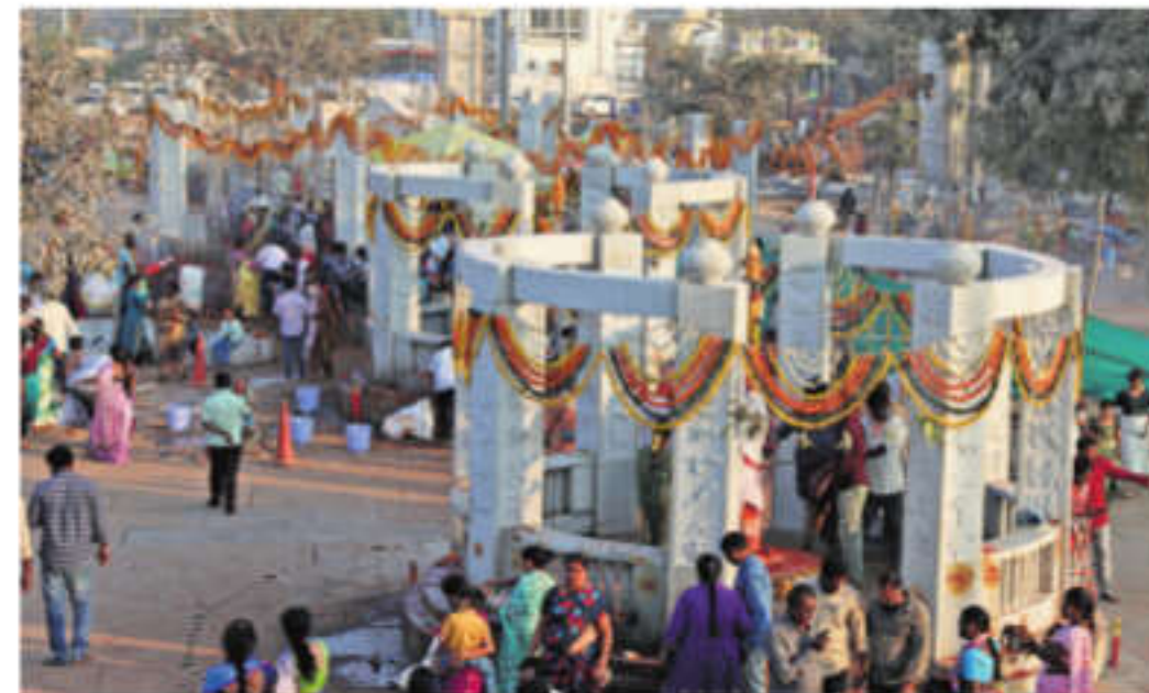
The newly constructed stone altars bedecked with flowers even as devotees offer prayers on Friday, much ahead of the biennial jatara

The state government has taken up works with an outlay of over ₹250 crore to give the historic Adivasi place of worship a facelift that blends history, tribal faith and modern infrastructure, while respecting Adivasi customs and offering a completely new experience to devotees. Officials said the development works are almost complete, at least in the core area.