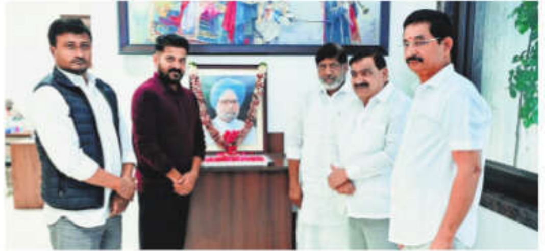
Chief Minister A Revanth Reddy and Deputy Chief Minister Mallu Bhatti Vikramarka pay floral tributes to a portrait of former PM Manmohan Singh in Hyderabad

"Dr Manmohan Singh earned the distinction of positioning India on the global economic stage through landmark economic reforms. Key decisions taken by him such as economic liberalisation, industrial development, and attracting foreign investments transformed the future of the nation," he added.