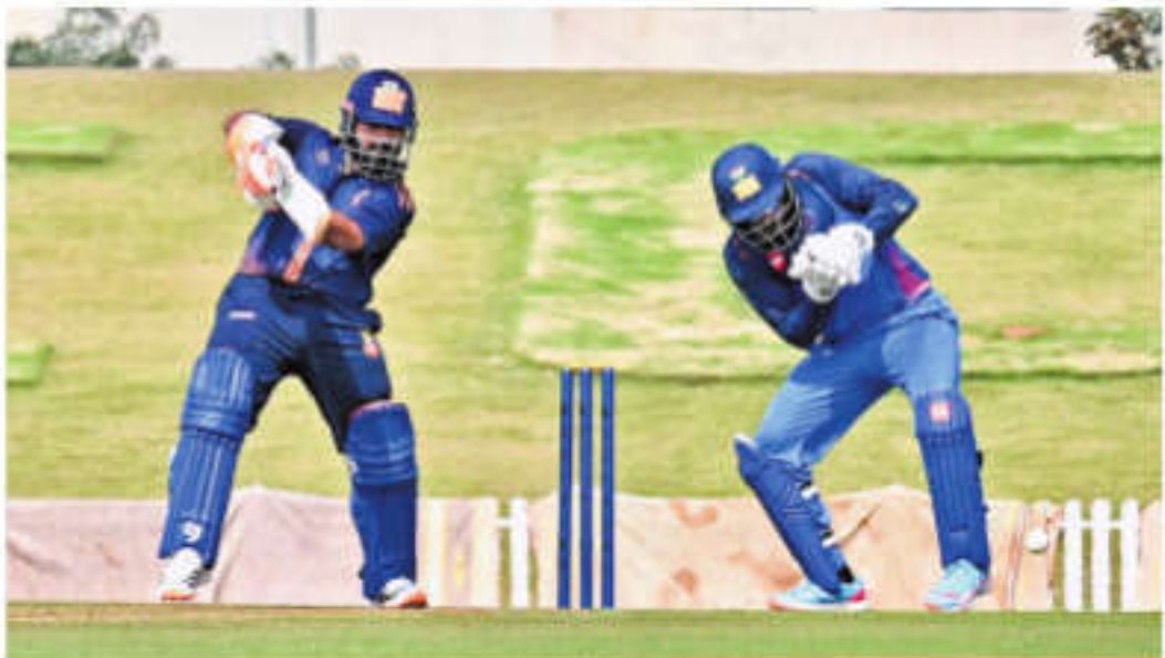
Rishabh Pant (L) in action against Gujarat on Friday

Before Pant walked onto the pitch, it was Virat Kohli who orchestrated Delhi's quick start. He rallied to a 29-ball half-centu-