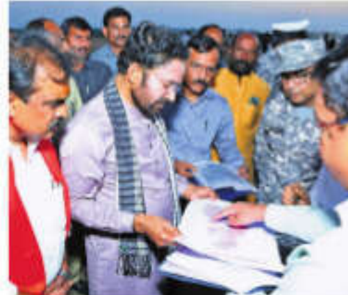
Union Coal and Mines Minister G Kishan Reddy inspects the site for the proposed airport in Adilabad on Friday

Kishan Reddy accused the previous BRS government, led by K Chandrashekar Rao, of "centralised corruption" for 10 years, alleging that public money was misused. He contrasted this with the current Congress government, which he de-